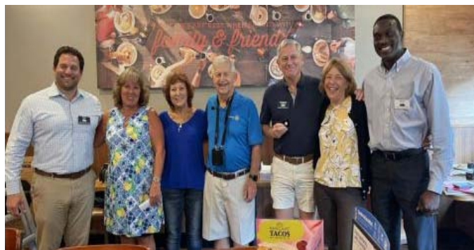
At a recent club meeting six club members were given recognition pins for their donations to The Rotary Foundation.